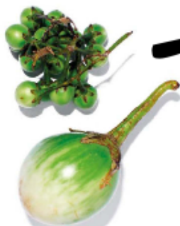
Thai cuisine uses different eggplants from the purple specimens that we are familiar with. The pea eggplant (above) grows in clusters and gives off hints of green apple. The apple eggplant (below) tastes like guava and is eaten raw with relishes. Both are commonly added to green curries.

The cuisine from the Land of Smiles is more than just pad thai noodles and tom yum soups. Maria Singh and Tiong Li Cheng explore its regional delights.